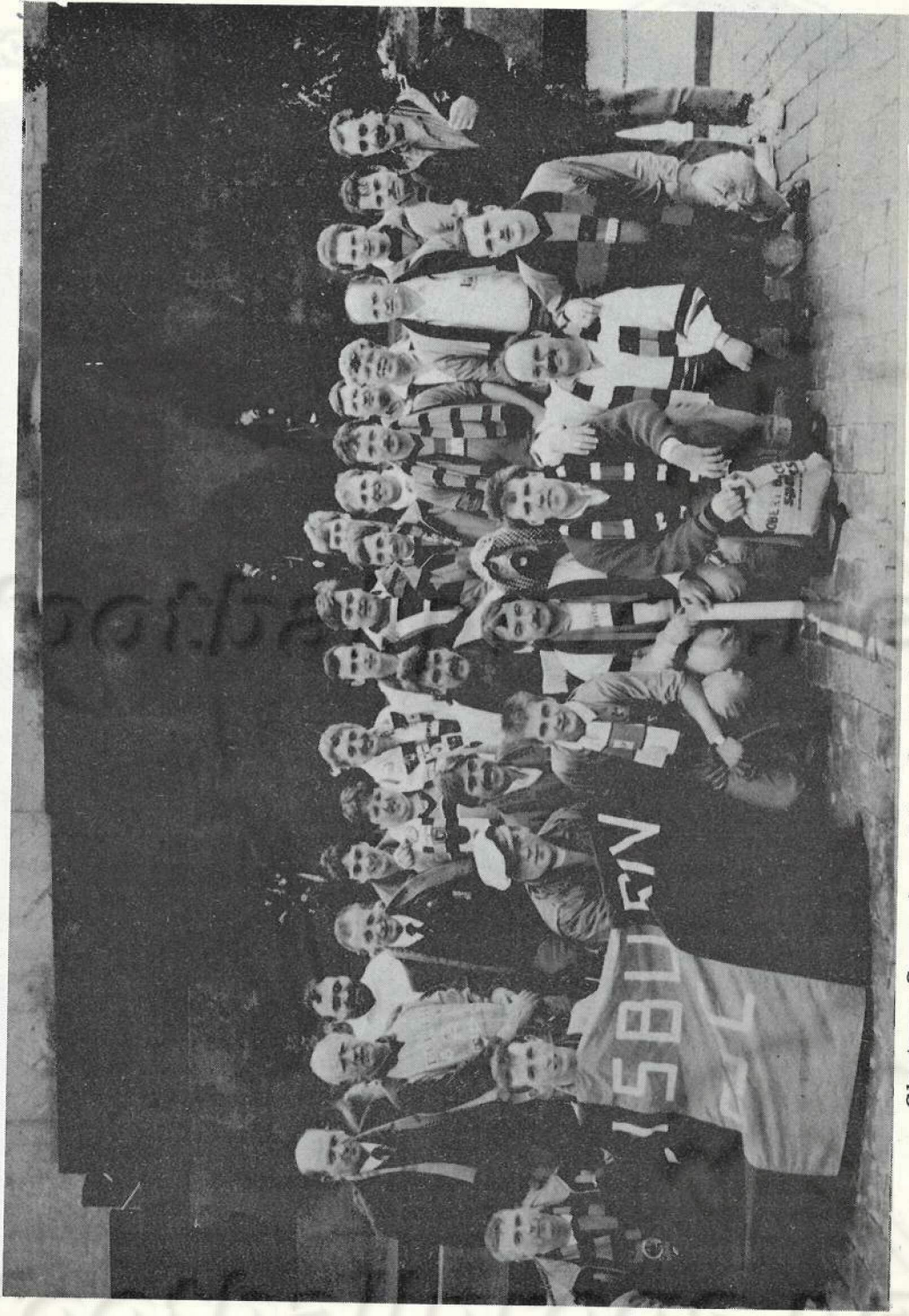
Glentoran Supporters pictured outside Lenins Tomb in Moscows Red Square.