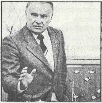
Manager Konstantin Beskov