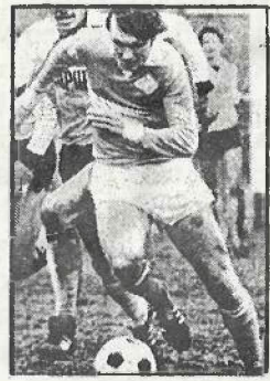
Star Striker Sergel Rodionov