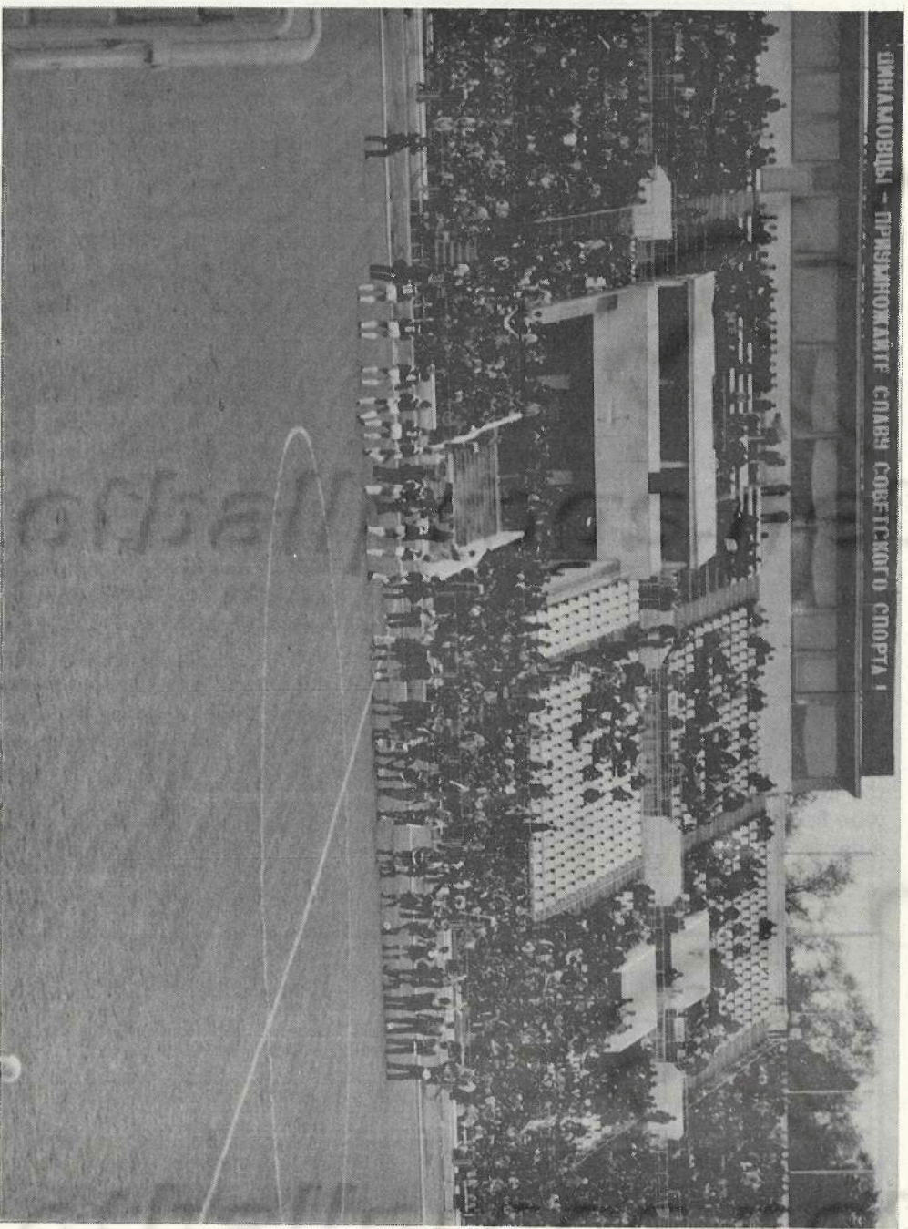
Spartak and Glentoran teams line-up before the start of the first leg in Moscow.

ДИНАМОВЦИ - ПИНСКОМОНТАЖЕ СНАБЪ СОВЕТСКОГО СПОРТА I